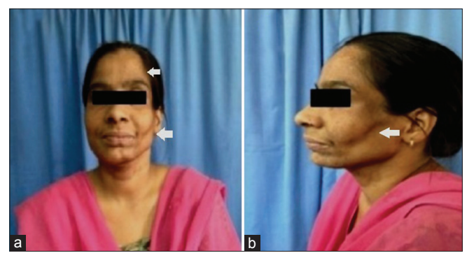
Figure 1: (a and b) Left hemifacial atrophy involving cheek, masseter, and temple (arrow)

due to the presence of progressive hemifacial and tongue atrophy, the possibility of PRS along with HMS was considered. In relation to HMS, HFS and unilateral focal jaw closing dystonia were two closest possibilities. In HFS, the initial site of onset is orbicularis oculi muscle (90%), the cheek (11%), and the perioral region (10%).<sup>[2]</sup> Moreover,