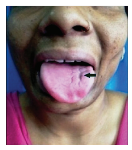
Figure 2: Atrophy of left half of tongue (arrow)