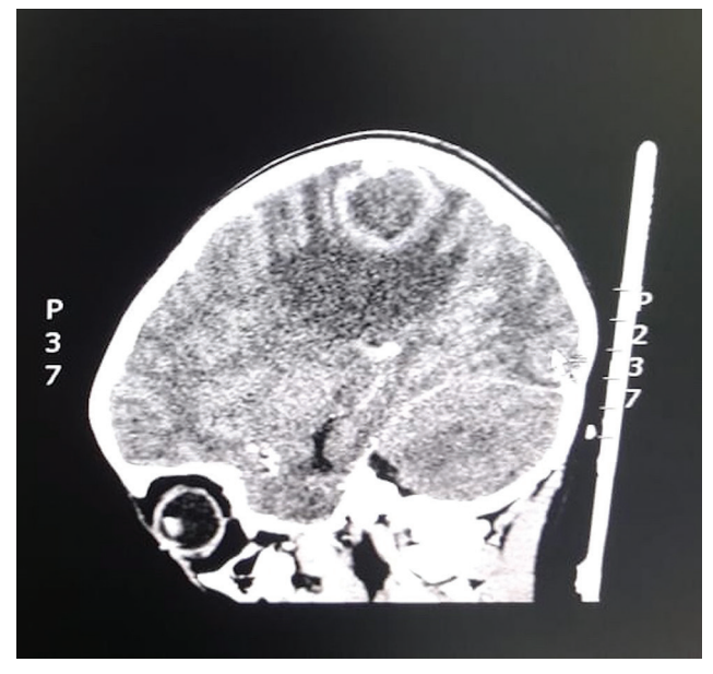
Fig. 1 Computed tomography (sagittal section) of the brain showing a ring enhancing well-defined hypodense lesion in the left frontal region with associated perilesional edema in adjacent frontoparietal white matter.