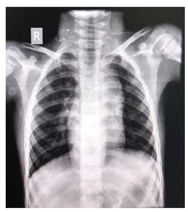
Fig. 2 Chest radiograph showing mesocardia as the longitudinal axis of the heart lies in the mid-sagittal plane and the heart has no apex.

Anesthesia was maintained with 1.5 to 2% sevoflurane (0.7–0.9 minimum alveolar concentration [MAC]) with air:oxygen mixture of 50:50 and nitrous oxide ( N_2O ) was avoided. Additional monitoring consisted of invasive blood pressure, nasopharyngeal temperature, and capnography (end-tidal CO_2 ). Intraoperative cardiac monitoring was done with transesophageal echocardiography (TEE). The mid-esophageal bicaval view was preferred during the burr