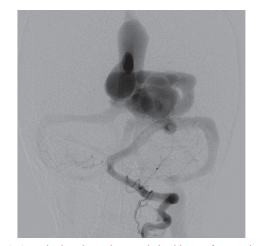
Figure 1: A cerebral angiography revealed evidence of an arteriovenous communication between posterior cerebral artery and distal anterior cerebral artery that drained to the sagittal sinus

Due to lack of nidus, the existing higher pressure gradient, which can make such lesions more prone for rupture, leading to relatively worse prognosis.<sup>[7]</sup> It has been reported the case of a pial AVM with dural substitution associated with dural venous sinus thrombosis. The pial fistulas that occur in the 1<sup>st</sup> years of life may be associated with disease syndromes such