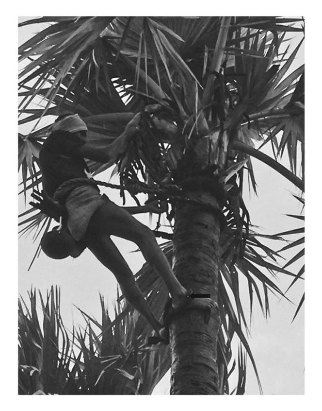
Fig. 2 A toddy tapper climbing up the palm tree with gujji (black arrow) wrapped around his ankles.

characteristically associated with ATTS; however, it does not find a mention in the medical literature. Consequently, we planned to estimate the prevalence of ATTS in toddy climbers and, therefore, to observe its causal association with this occupation.