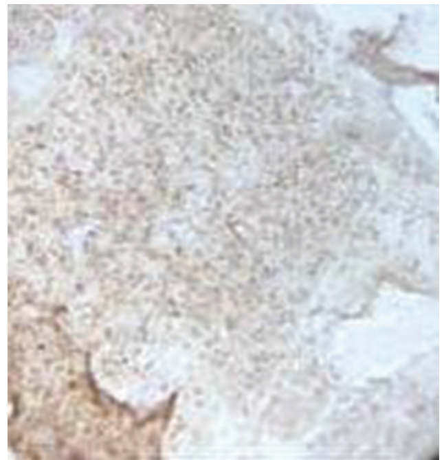
Fig. 2 Isocitrate dehydrogenase (IDH1) immunoreactivity in glioma.

Chronic inflammation has been accepted as one of the hallmarks for cancer. 16 Many studies have suggested role of chronic inflammation in cancer pathogenesis. Chronic inflammation results in changes in levels of circulating neutrophils, lymphocytes, monocytes, platelets, eosinophils,