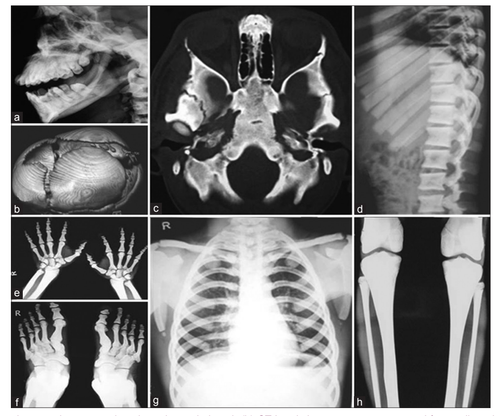
Figure 2: (a) X-ray showing obtuse gonial angle and crowded teeth (b) CT head showing open sutures and fontanelle with multiple Wormian bones (c) Axial CT head, showing sclerosed skull base (d) Dorsolumbar spine X-ray showing sclerosed, spool shaped vertebrae (e) X-ray both hands and (f) Feet showing acro-osteolysis (g) Narrow chest; the clavicles do not appear hypoplastic in this case (h) X-ray both legs, showing sclerosed long bones; there is no 'bone within bone appearance' or 'Erlenmeyer flask deformity' thus differentiating from osteopetrosis. Also see the supplementary file

A variety of neurological abnormalities have been described in the various skeletal dysplasias however; pycnodysostosis seems to have been spared at large.<sup>[9]</sup> Porencephalic cysts have been reported only once earlier.<sup>[3]</sup> The authors proposed that the persistence of open sutures and fontanelles allows the normal but unopposed intra-ventricular fluid pressure to progressively distend the brain parenchyma.