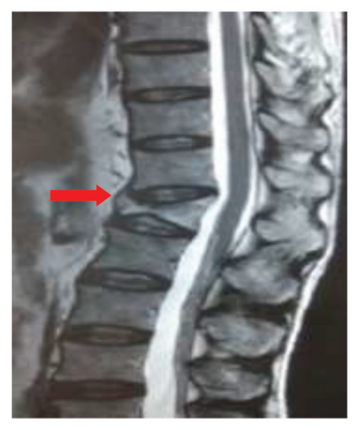
Fig. 3 T2WI MRI dorsal spine-sagittal view compression fracture of D12 vertebrae (red arrow). MRI, magnetic resonance imaging; T2WI, T2-weighted.

Since brucellosis has a very variable clinical presentation, the diagnosis needs a clear history of some form of exposure to animals or animal products along with a consistent disease pattern. In developing countries like India only serological tests are available. These tests detect antibodies by agglutination tests (tube or plate methods) and ELISA test. In endemic