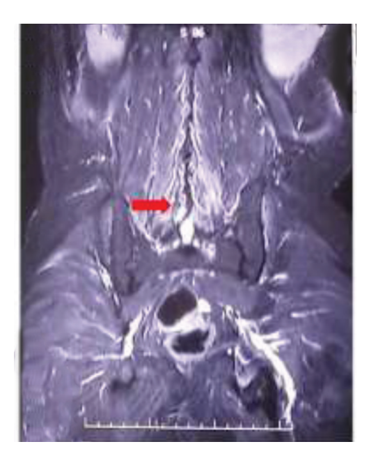
Fig. 2 STIR edema involving paraspinal muscles (red arrow). STIR, short tau inversion recovery.

with a bad prognosis. It usually manifest with meningitis, encephalitis, meningovascular disease, brain abscesses, or demyelinating syndromes.<sup>3,6</sup> Myelitis or myeloradiculopathy is very rare to happen and reported in only 1.2 to 3% cases of neurobrucellosis.<sup>6</sup> Brucella causes involvement of spinal cord by various mechanisms, which include infectious process itself, immune mechanisms, septic embolization, or venous thrombosis due to brucella vasculitis. Encephalopathy in brucellosis is thought to be due to vascular involvement.<sup>6</sup> Our patient had rare manifestations of both encephalopathy and myeloradiculopathy.