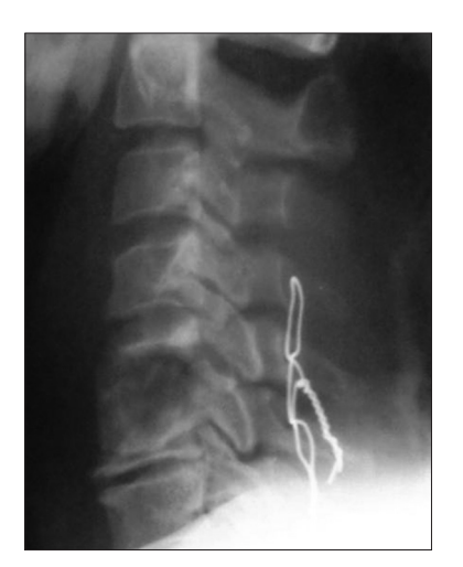
Figure 1: Cervical spine X-ray [lateral view] of a patient who had interspinous wire (Rogers technique<sup>[6]</sup>) after an anterior corpectomy with no evidence of canal penetration