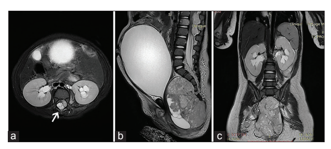
Figure 1: T2-weighted magnetic resonance imaging in axial (a), sagittal (b) and coronal (c) views showing a huge tumor mass arising from the sacrococcygeal junction; occupying the pelvis, and reaching the subcutaneous tissue (the associated epidural metastatic location at the level of L1 causing important thecal sac compression [arrow])

Adjuvant cisplatin-based high dose chemotherapy was administered, and the patient was enrolled under an intensive care and rehabilitation program. Her condition barely improved namely for the motor weakness, and AFP levels decreased to normal limits within 1-month of intensive chemotherapy.