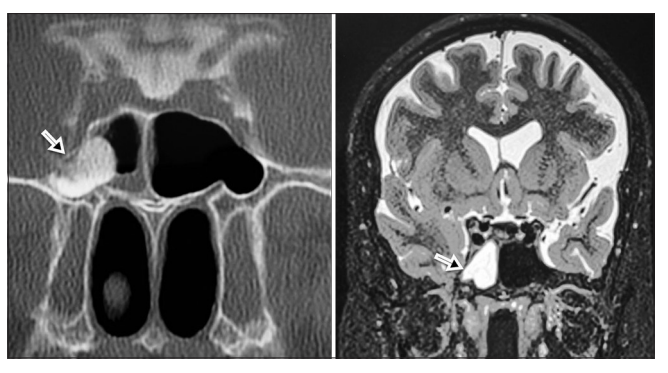
Figure 1: Coronal cranial MRI (T2-weighted) and CT cisternography images of the patient. Arrows showing the lateral sphenoid sinus meningocele

Spontaneous meningocele of lateral sphenoid sinus is an extreme incident without a well understood etiology. Anterior skull base meningoceles could be classified based on the location as described by Van Nouhuys and Bruyn: Sphenoorbital, sphenoethmoid, transethmoid (cribiform), sphenomaxillary, and transsphenoid.<sup>[7]</sup> Medial parasellar lesions are relatively more common and may occur with the empty sella syndrome.<sup>[1]</sup> The lateral wall meningoceles of the sphenoid sinus are uncommon and generally occur in 26-40% of the patients that have extensive lateral sphenoid sinus pneumatization into the pterygoid process.<sup>[8]</sup> A defect of the middle cranial fossa may result in herniation of the temporal lobe into the sphenoid sinus and CSF leakage.<sup>[1]</sup> Congenital lateral sphenoid sinus meningoceles are exceedingly rare and theoretically arise from the developmental errors that