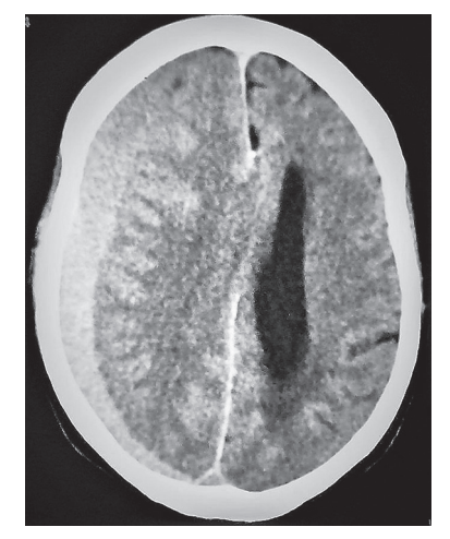
Figure 1: Preoperative computed tomography brain plain demonstrating isodense collection in right frontoparietal region suggestive of subacute subdural hematoma with mass effect over the right lateral ventricle with midline shift to left

For the 52 patients included in this study, mean age of the patient was 33.69 years (range 18–40 years), mean thickness of CSDH was 15.47 mm, and mean midline shift was 11.26 mm. 61.54% patients were male [Table 1], trauma being the most common etiology (92.31%) [Table 2] with most common presenting complaint being headache (90.38% patients) [Table 3]. 13 (25%) patients were alcoholic and 10 were smokers(19.23%) [Table 4]. 69.23% patients presented within 1 day of onset of symptoms [Table 5]. On CT scan, most of the patients were having SDH thickness between 11 and 20 mm (67.31%) [Table 6]