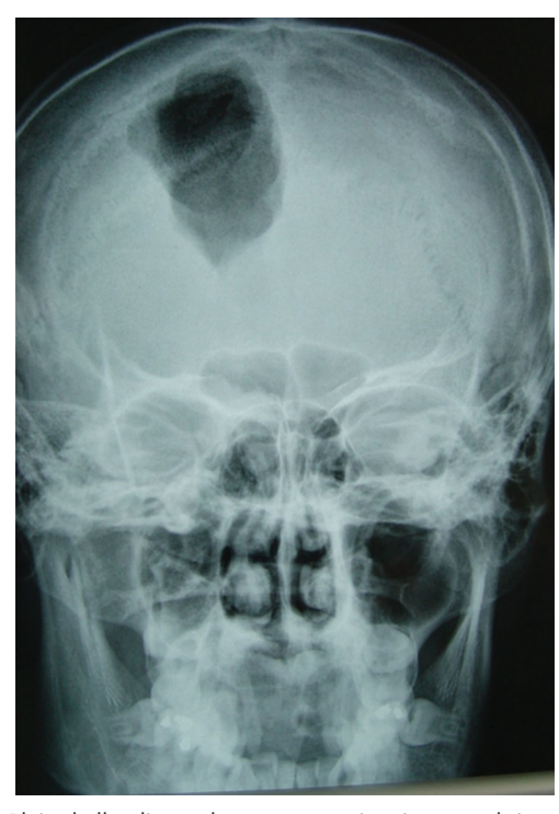
Fig. 1 Plain skull radiograph anteroposterior view reveals intracranial air collection.

frontoethmoid bony mass of 5 cm in diameter and a right frontal intracranial air collection (> Figs. 2 and 3). There was