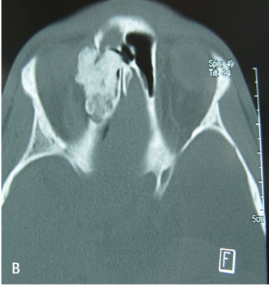
Fig. 3 Coronal (A) and axial (B) bone window computed tomography of paranasal sinus demonstrating lobulated osseous lesion within the right frontal sinus associated with intracranial air collection.