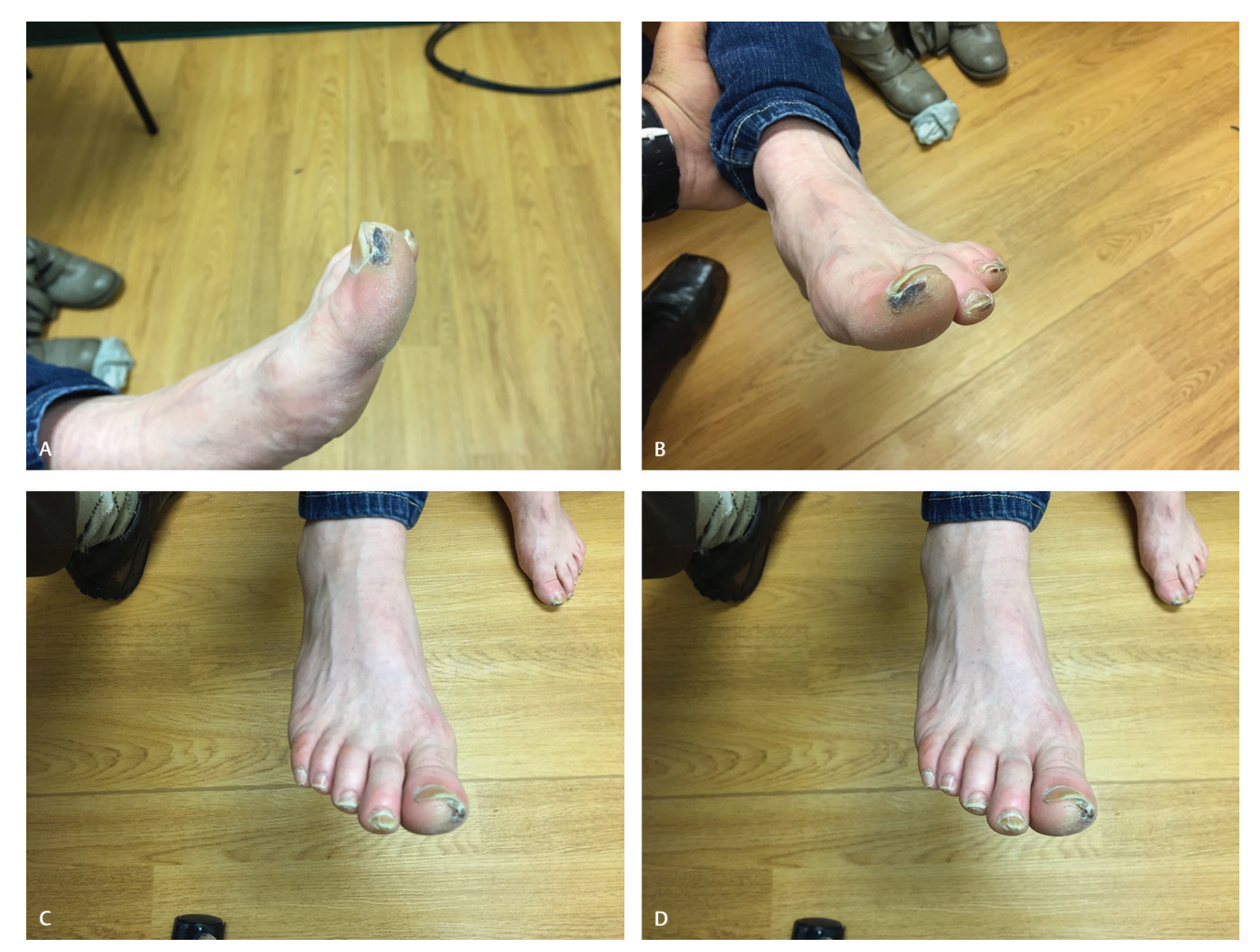
Fig. 1 (A–D) The toes show the calluses that were formed due to the constant curling of the toes. The curling itself was not painful but the resultant calluses were painful.

In a subset of those patients, similar movements were noticed without any associated pain and this was described as a separate entity of painless legs and moving toes syndrome by Walter et al.<sup>3</sup> This syndrome consists of continuous or semi-continuous involuntary writhing movements of the toes without any associated pain in the affected extremity. These movements include torsion, abduction, adduction, flexion, and extension movements of toes with the absence of pain.