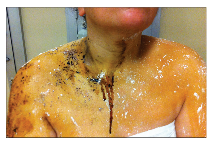
Figure 1: Sweat test

It was learnt that the patient was examined in detail by chest diseases polyclinic 5-6 years ago due to chronic cough (thoracic computed tomography, pulmonary function tests, purified protein derivative (PPD) test, allergy panel, complete blood count) but no cause could be found. The cough was refractory to therapeutic trials of inhaled, nasal, and oral steroids, lignocaine spray and nebulizer, local anesthetic lozenges, and oral H2 antagonists. A trial of bornaprin HCl orally 4 mg/day was applied for compensatory hyperhidrosis. No adverse effect was observed except drug-related moderate dryness for 6 months and the symptom was partially decreased.