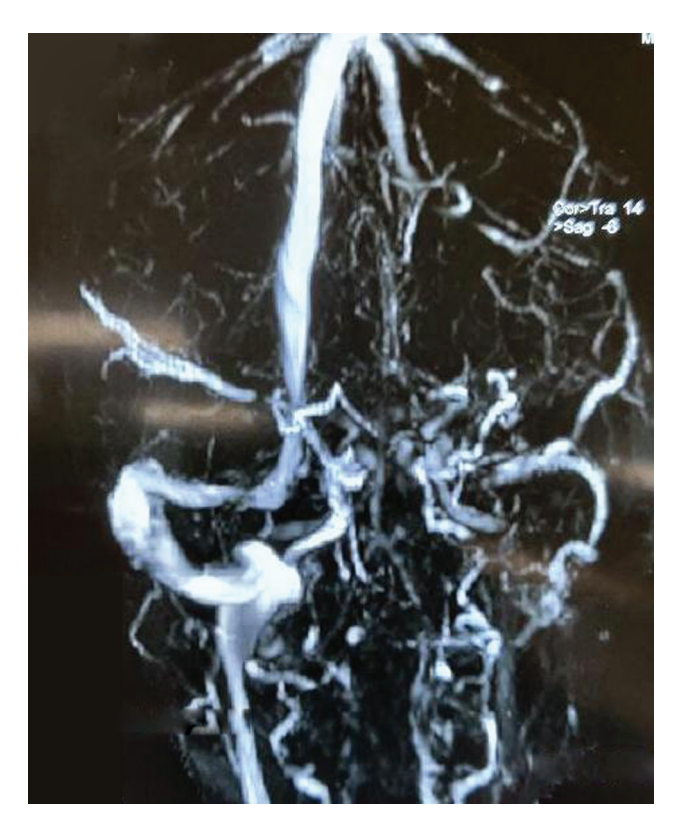
Fig. 3 Magnetic resonance venogram coronal plane showing no flow related enhancement seen in bilateral internal cerebral veins, vein of Galen, and straight sinus suggestive of thrombosis.