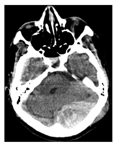
Figure 3: A computed tomography scan showing a left cerebellar extradural hematoma. The hematoma extended to the supratentorial space and detached the sinus confluence, the left transverse sinus, and posterior third of the sagittal longitudinal sinus

spots are exposed, they can be electrocoagulated, clipped, and stopped with the aid of hemostatic agents. In every case the suspension of the dura mater is essential, where it guarantees a mechanical tamponade, thus minimizing the risk of postoperative rebleeding.