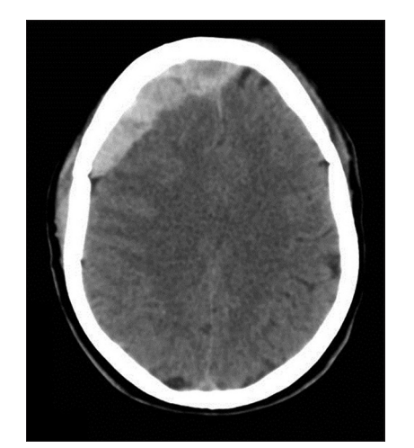
Figure 1: A computed tomography scan showing a right frontal extradural hematoma with contralateral extension and detachment of the sagittal longitudinal sinus

A classic localization of an EH is temporal with involvement of Marchant's area, where the middle meningeal artery has a bigger diameter and the pressure from the ruptured artery can easily detach the dura mater. The more the EH is located toward the midline, the slower the bleeding may be and, once surgically exposed, the external surface of the dura mater may present with diffuse bleeding. Often it is not possible to recognize a specific bleeding spot. In every case the surgical goal is to decompress the neural structures and to arrest the bleeding. If the middle meningeal artery is ruptured in a proximal site toward the foramen spinosus, it can be exposed and clipped. If multiple and distal bleeding