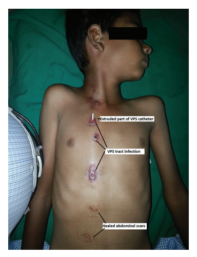
Figure 1: Clinical photograph showing ventriculoperitoneal shunt tract infection, and migrated end of the shunt catheter at the chest area, and healed abdominal scars

He was managed with the removal of the entire VPS catheter under sedation. The VPS chamber along with the peritoneal catheter was removed easily from the chest area [Figure 5a]. During the removal of the VPS chamber and peritoneal catheter, it was observed that the chamber and the entire peritoneal catheter were loaded with fecal matter, and it was presumed that the peritoneal catheter was within the large bowel [Figure 5b],