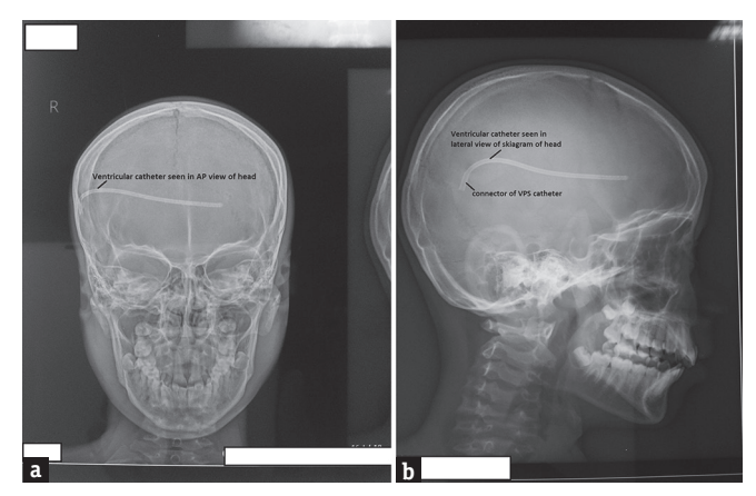
Figure 2: (a) Skiagram of the head (anteroposterior view) showing ventricular part of the ventriculoperitoneal shunt catheter. (b) Skiagram of the head (lateral view) showing ventricular catheter and connector