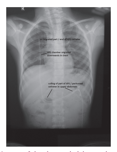
Figure 3: Skiagram of the chest and abdomen showing migrated ventriculoperitoneal shunt chamber at the upper chest and coiling of the part of peritoneal catheter in the upper abdomen

although digital rectal examination felt to palpate the catheter. The ventricular catheter along with the