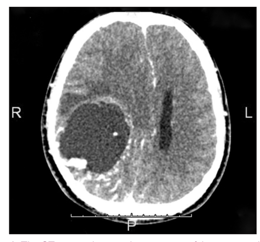
Figure 1: The CT image showing the presence of the intra-axial space occupying lesion in the right hemisphere

dominant disorders characterized by hamartomas and benign neoplastic lesions that affect the central nervous system and various non-neural tissues. This disorder affects around 25 000 to 40 000 individuals in the United States and about 1-2 million individuals worldwide.<sup>[1]</sup> Apart from known manifestations seen in the skin, eyes, kidney, heart, digestive system and lung, the central nervous system manifestations of tuberous sclerosis are cortical tubers (freq 90-100%), subependymal nodules (90-100%) and white matter hamartomas and heterotopias (90-100%). The variety of astrocytomas commonly associated with tuberous sclerosis is the SEGA with incidences ranging from 6% to 16%. This findings in this case is unique in that the variant of astrocytoma is hitherto not reported nor described in the current literature, i.e. that of a pleomorphic xanthoastrocytoma.