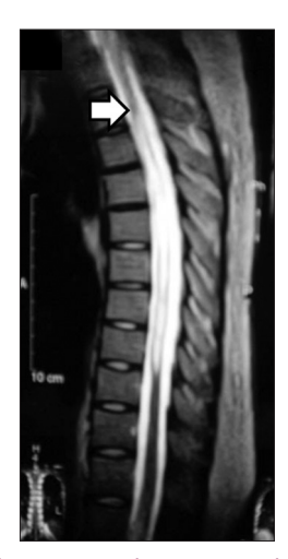
Figure 1: MRI myelogram revealing anterior displacement of spinal cord at D_1-D_8 level with no intrathecal contrast above D_1 level (Case 1)

A 5-year-old male child was admitted with history of low-grade fever, irritability, and headache for 4 months. Total lymphocyte count in peripheral