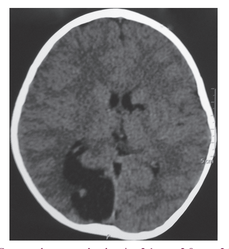
Figure 1: Computed tomography showing 2.1 \text{ cm} \times 2.8 \text{ cm} \times 2.7 \text{ cm} sized cystic lesion in the right occipital lobe with small nodule

occurs as a result of prolonged degeneration of multiple small hemorrhages into xanthochromic fluid. These patients usually have a history of recurrent headache. The latter usually results from exudation of fluid from the mural nodule associated with the AVM. These patients do not have recurrent headaches. Hatashita et al. <sup>[7]</sup> studied the histology of the cyst wall and showed numerous thin-walled vascular channels and deposits of fibrous tissue, which are also seen in the membrane of the giant cysts associated with cavernous angiomas. This hence suggested the formation of a capsule around a minor hemorrhage from the AVM which in turn resulted in a cyst formation. The growth of such a cyst was a result of repeated subclinical hemorrhages from the neovascular channels of the cyst wall.