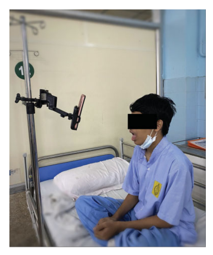
Fig. 1 Figure showing the patient being evaluated through a video call with a smartphone held by an adjustable holder fixed on the bedside infusion stand.

by the anesthesiologist whose image appears on the right upper corner. The real-time video call was performed, and data transmission was within the institutional firewall and AES-128 encrypted (certified by the US Department of Defense). Staff at the neurosurgical ward received training in the setting up and use of the telemedicine equipment, along with patient positioning needed for the airway examination, to facilitate completion of the VAA.