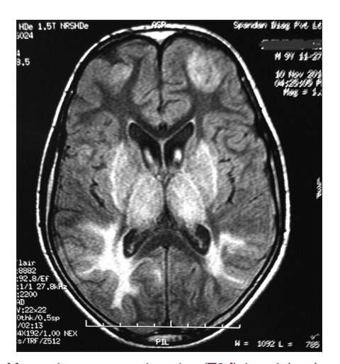
Figure 2: Magnetic resonance imaging (T2 flair weighted sequences) shows symmetrical hyperintensities in frontal and parieto-occipital region and basal ganglia