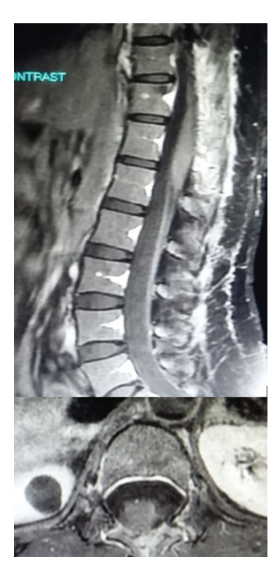
Figure 3: Five-month postoperative T1-weighted image sagittal and axial magnetic resonance imaging images

reported an excision of a cyst, extending from D4 to L3 spinal segment after performing open door laminoplasty for a 15-year-old boy.<sup>[12]</sup>