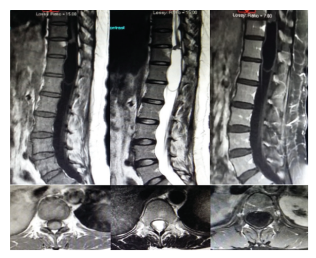
Figure 1: Preoperative T1-weighted image, T2 weighted image and Gadolinium (GAD) contrast sagittal and axial magnetic resonance imaging images of intradural extramedullary cerebrospinal fluid signal intensity mass lesion opposite D11, D12, and upper border of L1 vertebrae

On inquiring again, the patient informed us that about 2½ years back, she had undergone a failed trial of spinal anesthesia during vaginal delivery after which she received general anesthesia. Her postpartum status was uneventful. About a year after delivery, she started having the symptoms for which she first visited her physician. Thereafter, we counseled her regarding our plan of surgical decompression. Peroperatively, after the opening of the dura, the cord seemed bulging with cyst being densely adhered to it. As soon as the arachnoid was opened through the cranial end of the cyst, its upper part got decompressed with egress of CSF. The caudal part of the cyst was then addressed, and fenestration was done through it. Part of cyst wall was sent for histopathological diagnosis. Postoperatively, the patient was mobilizing after 24 h and on the 3<sup>rd</sup> day of surgery, she was discharged home. The histopathology report showed that the cyst wall was made up of fibrous tissue rather than any meningothelial cells, suggestive of a pseudo arachnoid cyst. On follow-up in clinic, her weakness in the proximal muscle group of the lower limbs had markedly improved. Her bladder and bowel incontinence was also getting better. The wound was healing well, and the stitches were removed on 10th postoperative day. Follow-up MRI done after 2 weeks and later at 5 months had shown a significant