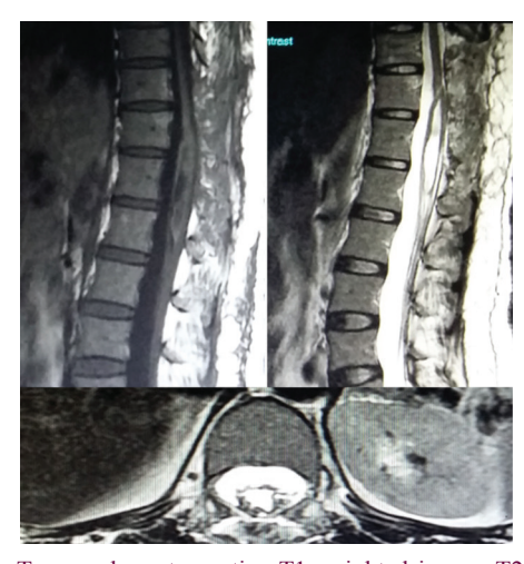
Figure 2: Two-week postoperative T1-weighted image, T2 weighted image sagittal and axial magnetic resonance imaging images showing significant reduction in size of lesion

In our patient, the symptoms started about a year after the event of failed trial of spinal anesthesia. Samuel in 2008 published the first ever case report of intradural arachnoid cyst after spinal anesthesia.[8] It usually presents itself in between fourth a sixth decade of life with a slight female predominance. [9] Our patient also presented in her early 40s. Her intradural arachnoid cyst was from D10 to L1 spinal level. Up to 80% of cysts are located in the middle and lower thoracic spine lying dorsal to the cord. Such a location in spine causes compression of the cord and nerve roots. Although may remain quiescent and only be evident on the radiological examination for some other symptomatology, ones progressively increasing in size can lead to a variable presentation. Rarely, they may rupture spontaneously and present with intracystic hemorrhage or with intracranial hypotension.<sup>[9]</sup> On average, these cysts have an extension of 3.7 vertebral bodies.[10] Giant arachnoid cyst with an extension from high dorsal to low lumbar has been described in literature.[11] In 2014, Gupta et al.