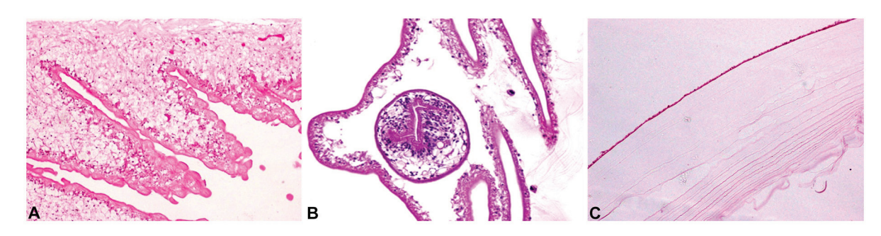
Fig. 2 Infective cysts: (A) cysticercal cyst, H and E, ×20, (B) hydatid cyst with scolex, H and E, ×20, (C) lamellated membranes of hydatid cyst, H and E, ×20. H and E, hematoxylin and eosin.