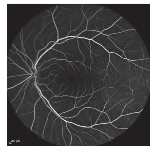
Figure 2: Fundus fluorescein angiography of the left eye performed immediately after the detection of vision loss reveals that the filling of the left retinal artery and vein is normal (15^{\text{th}} \text{ s})

The underlying mechanism of postoperative visual loss has not yet been fully understood.<sup>[9]</sup> Its etiology could not be fully elucidated in most of the cases; however, most of them are considered to be multi-factorial.<sup>[10]</sup> Of the cases reported so far, 67% has been found associated with the spinal surgeries performed in the prone position.<sup>[9]</sup> Preoperative risk factors include male gender, hypertension, diabetes, hyperviscosity syndromes (sickle cell anemia, polycythemia vera), smoking, renal failure, narrow-angle glaucoma, atherosclerotic vascular disease, and collagen-vascular diseases.<sup>[4,9,10]</sup> Perioperative