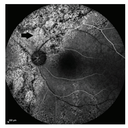
Figure 4: Fundus fluorescein angiography of the left eye performed at the 4^{th} week of vision loss reveals thinned vascular structures and their delayed filling. Black arrow indicates hypo-fluorescent area secondary to retinal atrophy on the left optic disc ( 14^{th} s)