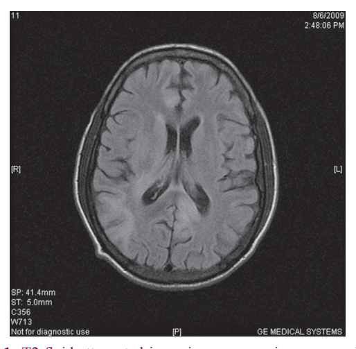
Figure 1: T2 fluid-attenuated inversion recovery images are showing small white matter hyperintensities in the right subcortical parietal region and in periventricular region