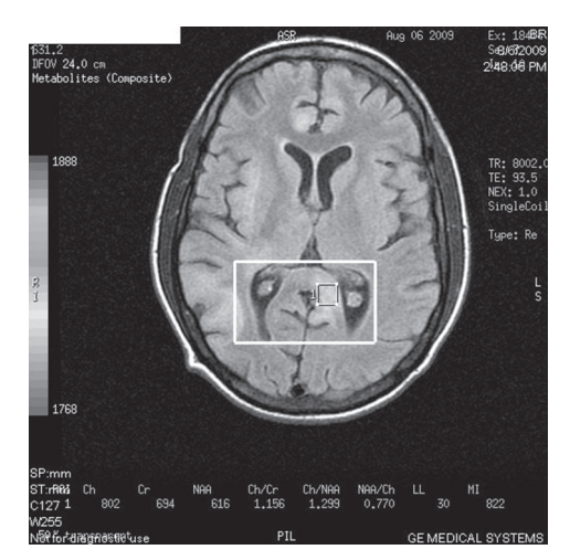
Figure 2: Magnetic resonance spectroscopy done in posterior periventricular lesion