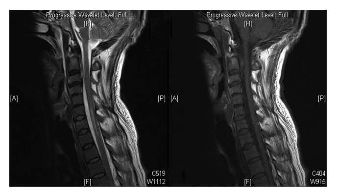
Figure 1: Non-contrast computed tomography cervical spine showing C4-C5 block vertebrae without any fracture or dislocation

Symptomatology of TSEHs vary from clinically silent to life threatening, with the rate of life risk reported to be as high as 23% in one study.<sup>[5]</sup> Common presenting features