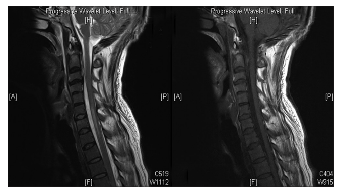
Figure 2: Sagittal section magnetic resonance imaging showing collection anterior to the cord compressing the cord and cord contusion at C6-C7