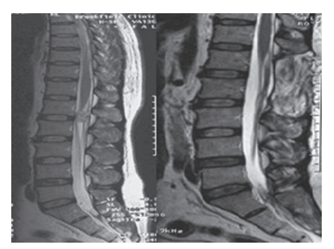
Figure 1: Preoperative and postoperative T2 magnetic resonance imaging showing L1 ependymoma

charts was conducted in this series analyzing the clinical presentation, spinal level, extent of surgery, complications, and follow-up. Data were cross-examined with the histopathological analysis results. Within the defined study period, no cases were excluded from the study.