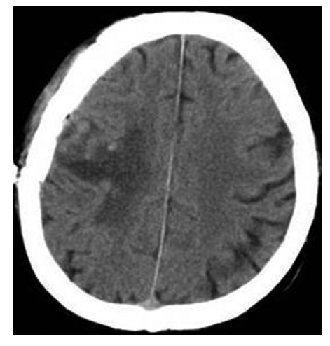
Figure 2: Postoperative axial cranial computed tomography image showing tumor removal with normal postoperative changes and persisting preexisting perilesional edema