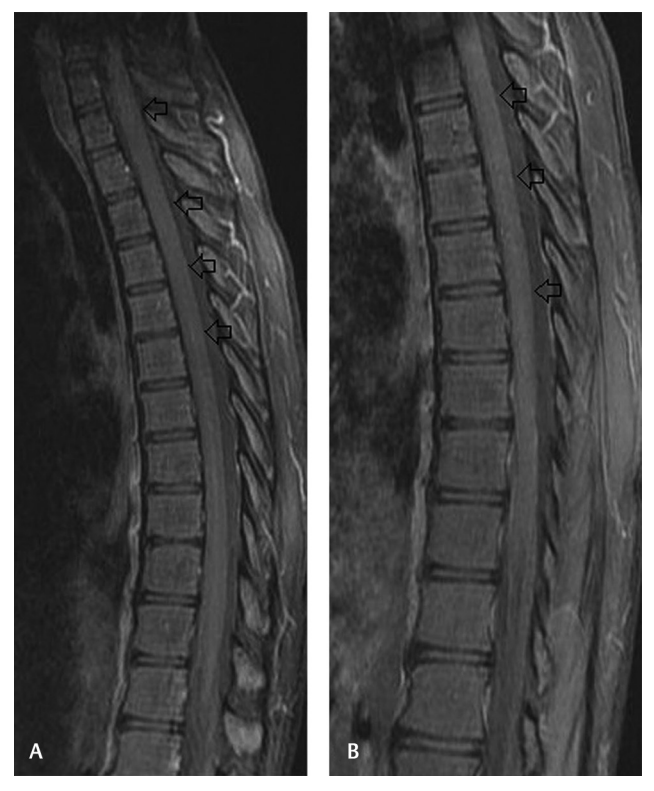
Fig. 2 ( A , B ) Sagittal postcontrast fat-saturated T1-weighted images showing no abnormal cord enhancement.

aquaporin 4 antibody (NMO IgG) was negative. Electrocardiogram, two-dimensional echocardiogram, and ultrasound of the abdomen were unremarkable. Bilateral visual evoked potentials were normal.