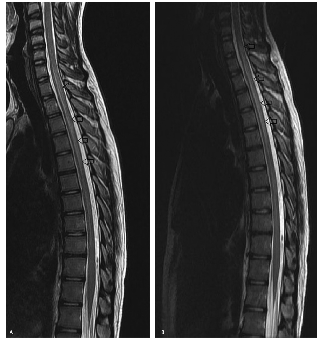
Fig. 1 (A, B) Sagittal T2-weighted images of the spine showing long-segment cord hyperintensity extending from C7 to D7 level.

intravenous steroids, he was further evaluated with chest radiograph which showed patchy infiltrates in right upper and mid-zones. Computed tomography (CT) of the chest revealed multiple clustered centrilobular nodules and tree in bud opacities with thin cavity in right upper lobe ( Fig. 3 ). Bronchoalveolar lavage (BAL) was done and showed mixed inflammatory cells mostly histiocytes, few neutrophils, and lymphocytes admixed with columnar cells and occasional squamous cells in mucoid background. Acid fast bacilli were seen and gene Xpert MTB/RIF (mycobacterium/rifampicin) revealed M. tuberculosis and resistance to rifampicin was not