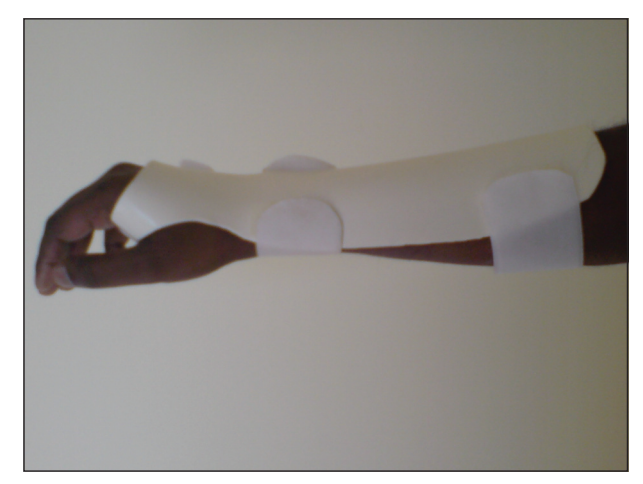
Figure 1: Custom-made volar forearm-based wrist-hand splint

Therapists appear to be referring to volar forearm-based wrist-hand splints [Figure 1] as two different splints namely, resting-position splint (placing the wrist in neutral position and thumb in radial abduction) and functional-position splint (placing the wrist in upto 30° of extension and thumb in opposition) both look to be