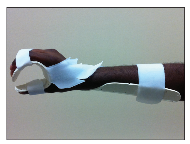
Figure 2: Custom-made dorsal forearm-based wrist splint

only minimally different from each other. The majority of the therapists 36(70.6%) preferred to prescribe volar forearm-based wrist-hand splints either alone or with dorsal forearm-based wrist splints [Figure 2] 15(29.4%); however, none of them opted for dorsal forearm-based wrist splints exclusively. Reasons reported for the prescription of volar splints were easiness in applying, clients' reported comfort, enhanced clients' splinting adherence, therapists' observed clinical benefits through experience and their familiarity in fabrication.