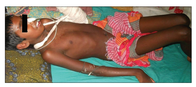
Figure 1: Photograph of the boy showing generalized hyperpigmentation

brain. Mild cerebral atrophic changes were also present [Figure 3]. The examination of cerebrospinal fluid did not reveal any abnormality. Serum cortisol level at 8 a.m. was 7.6 \mu g/dl (normal range 3.7-19.4 \mu g/dl). Serum very long chain fatty acid (VLCFA) could not be done due to nonavailability of facilities. On the basis of reduced serum ceruloplasmin, raised 24-hour urinary copper (both unchallenged and challenged) and presence of KF rings the diagnosis of Wilson's disease was established.