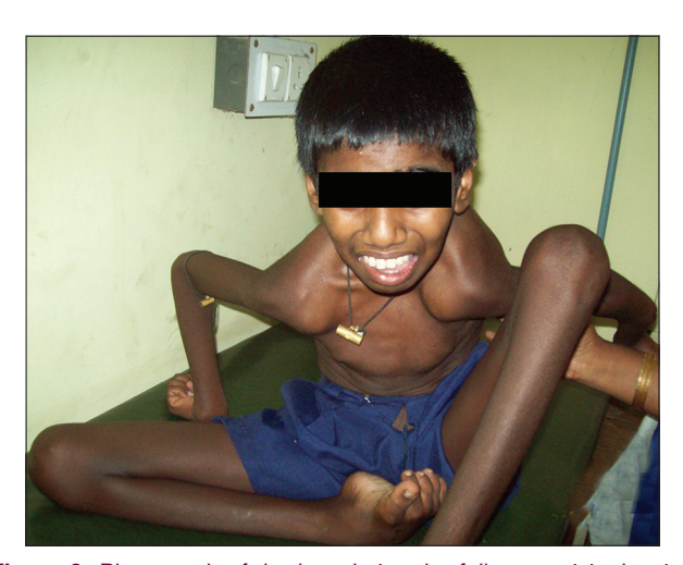
Figure 2: Photogragh of the boy during the follow-up visit showing hyperpigmentation and deteriorating neurological impairment