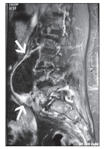
Figure 1: Abscess, lying along the right psoas muscle due to pyogenic spondylodiscitis caused by Streptococcus intermedius in T1 weighted sagittal magnetic resonance imaging scan

Spinal infections can be described etiologically as pyogenic, granulomatous (tuberculous, brucellar, fungal) and parasitic.<sup>[8]</sup> SD, a term including vertebral osteomyelitis, spondylitis and discitis, besides being a factor of severe morbidity because of the neurological sequelae, is an important health problem due to the administration of parenteral antibiotic during long-period hospitalization, bed occupation in service, high cost and invasive diagnostic investigations, and requirement of surgical treatment.<sup>[8]</sup>