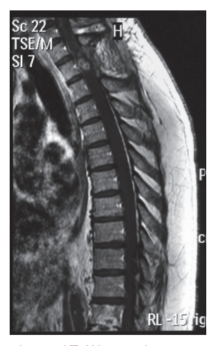
Figure 3: Contrast enhanced T1W sagittal magnetic resonance imaging images at level C7 show intramedullary expansile spinal tuberculoma with peripheric enhancement and spondylodiscitis between T12-L1

Approximately 37% of spontaneous PSD will not have an definitesource.<sup>[14]</sup> The common organisms including Staphylococcus aureus and streptococcus species and Gram-negative bacilli as intravenous drug users are frequently isolated. Stapylococcus species were the responsible pathogen in seven of the nine cases with PSD. In our study, no pathogenic or suspicious origin was determined in 30% of the SD cases even by the invasive diagnostic tests. In developed countries, Mycobacterium tuberculosis, fungal infections and parasitic infestations are common in immunosupressve patients.<sup>[15-17]</sup> In the countries with prevalent tuberculosis and brucellosis such as our country, granulomatous SDs cases are of the major clinical forms.<sup>[13,18-21]</sup> In our study, PSD rate is also significant (36%). However, many of PSD cases are followed up by neurosurgeons and orthopedists in our hospital. Only PSD cases which applied to our department, and were given medical treatment without surgery, were included in this study. Therefore, the actual numbers may not have been recorded. The medical