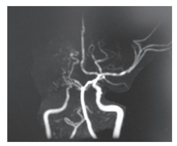
Figure 2: Right middle cerebral artery occlusion