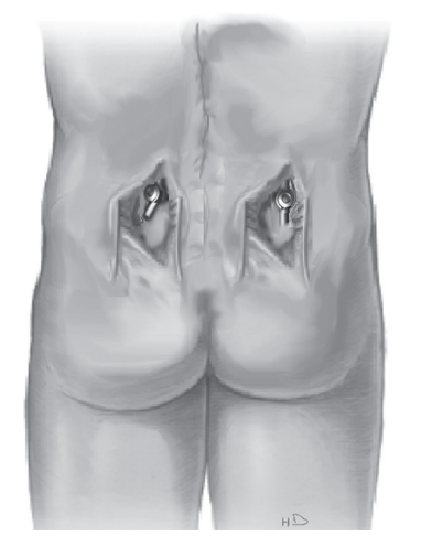
Figure 3: An illustration of bilateral paramedian incisions depicting exposure of only the lower end of the long segment fusion construct to facilitate sacroiliac fixation

Despite advances in techniques of lumbosacral fixation, pseudoarthrosis at the lumbosacral junction is not an uncommon problem. This is partly due to a large pedicle of the sacrum which often provides less rigid fixation