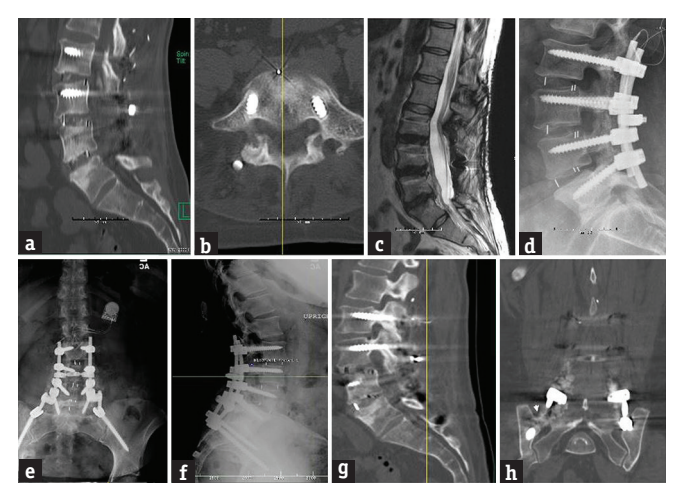
Figure 2: Preoperative (a and b) computed tomography scan and (c and d) magnetic resonance imaging of a patient with a previous lumbosacral fusion with evidence of pseudoarthrosis. (e) Anteroposterior and (f) lateral postoperative radiograph after minimally invasive extension of the fusion to the pelvis. Six months' postoperative (g) sagittal and (h) coronal computed tomography scan showing evidence of fusion from the pelvis to L5

The L5/S1 levels were localized using fluoroscopy. Two Wiltse type incisions were made measuring 3 cm in length. Anteroposterior fluoroscopy was used to make the incision centered on the caudal end of the instrumentation. The monopolar cautery was used to