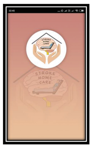
Figure 1: Logo of the application.

The app's logo represents a stroke survivor lying on the bed in Semi-Fowler's position and a hand representing the caregiver in the home environment [Figure 1]. In addition, the web-based application uses a website as an interface,