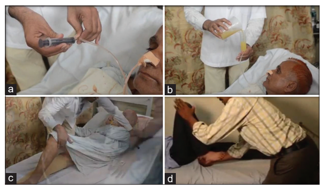
Figure 5: (a-d) Screenshots of the videos demonstrating intervention protocols.