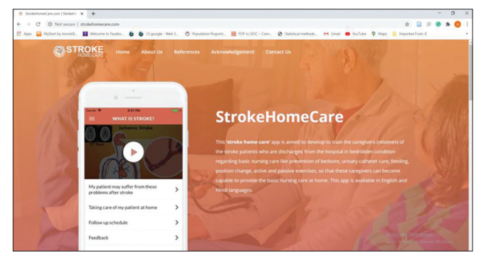
Figure 2: The introductory web page of the "Stroke Home Care" application.

www.strokehomecare.com. A brief description of the SHC app is provided on the home page of the website, and various navigation icons such as home, about us, references, acknowledgment, and contact us are also provided [Figure 2].