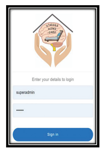
Figure 6: Administrative module protected by username and password.

(24%) were satisfied with the App experience. None of the caregivers were dissatisfied or highly dissatisfied.