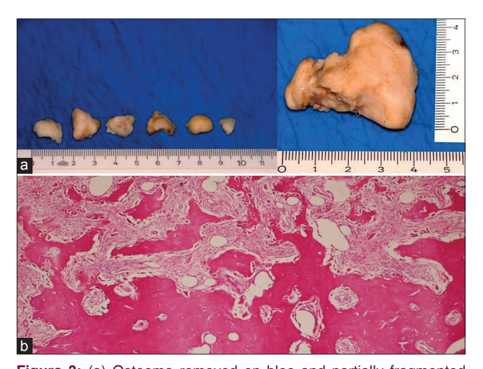
Figure 3: (a) Osteoma removed en bloc and partially fragmented via transcranial frontobasal approach. (b) The specimen verified the osteoid osteoma composed of mature bone lamels and nidus which is composed of small bone trabeculae surrounded by osteoblasts.