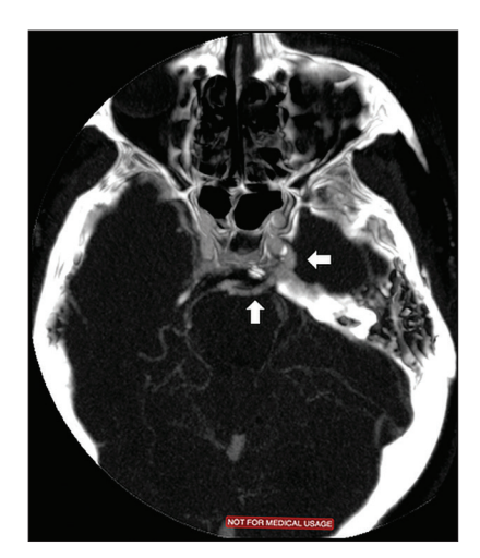
Figure 1: Persistent trigeminal artery on computed tomography angiogram

The PTA was initially described by Quain in 1844 in an autopsy case. Later, Sutton demonstrated PTA angiographically in 1950.<sup>[1,2]</sup> The incidence of PTA varies between 0.1% and 0.6%.<sup>[1]</sup> It is the most cephalad of the embryonic carotid – basilar anastomosis. The PTA originates from the ICA at the proximal part of the cavernous segment. It can take either a lateral (petrosal type) or a medial (sphenoidal type) course to reach the posterior fossa.<sup>[2,3]</sup> The PTA joins the basilar artery between the superior cerebellar and the anterior inferior cerebellar arteries (AICAs). In Saltzman type I