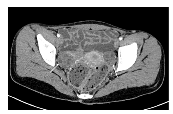
Fig. 1 Computerized tomography scan of the pelvis. Axial section showed multiple small cysts in bilateral ovaries (arrow).

during follow-up visits over 2 years. Neurological adverse events including dizziness, memory deficits, insomnia and in our case, tremors were the most common adverse effects responsible for VPA monotherapy discontinuation in a randomized controlled trial of childhood absence epilepsy.