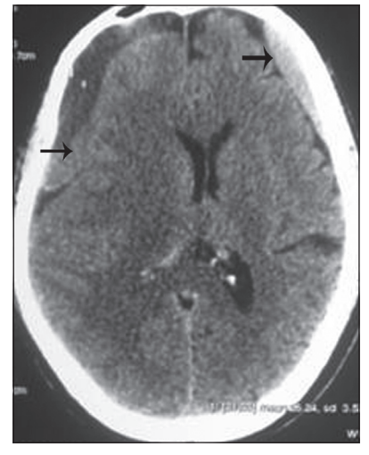
Figure 2: Axial CT brain shows bilateral large frontotemporoparietal subacute on chronic subdural hemorrhage about 2 cm in thickness on both sides, with significant midline shift (black arrow)