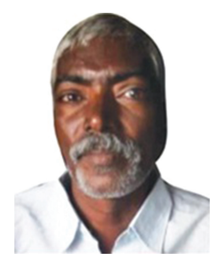
Figure 2: After treatment with antithyroid drugs and immunotherapy

The coexistence of Graves' disease with MG is known for more than a century. The exact relationship between these two entities is yet unclear. It is said to be a common genetic mechanism operating between these two and a common autoimmune target in ocular muscles. HLADQ3 was found to have a coexistence in 5 out of