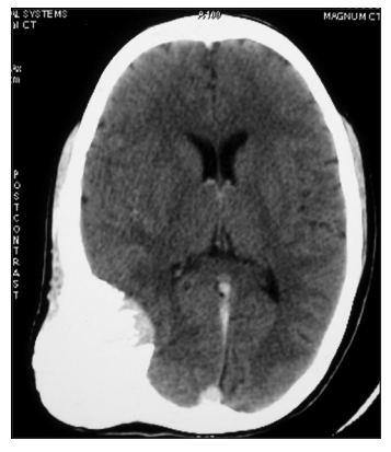
Figure 2: Postcontrast axial CT scan showing a uniformly hyperdense mass in the right high parietal region with contrast enhancing extradural tissue. There is evidence of buckling of underlying gray matter