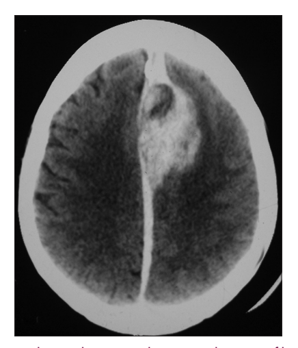
Figure 1: Non-enhanced computed tomography scan of brain showing an acute interhemispheric left-sided subdural hematoma with maximal thickness in the left frontal parafalcine region with a hypodense area inside it focally compressing the medial frontal lobe anteriorly

Around 1.5-5.4% of intracranial tumors present following hemorrhage.<sup>[1]</sup> Among meningiomas, only 1.3% are reported to show hemorrhage, and this risk is higher in angioblastic and malignant meningiomas.<sup>[2,3]</sup> However, none of the 313 patients with meningiomas reported by Cushing and Eisenhardt or the 280 cases of parasagittal meningiomas reported by Hoessly and Olivecrona presented with hemorrhage.<sup>[4]</sup>