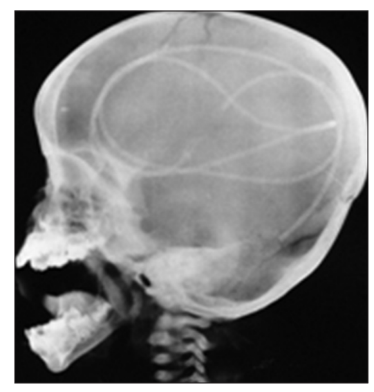
Figure 1: Lateral X-ray of skull showing entire shunt tube inside the cranium

chamber firmly anchored to the pericranium. The child improved clinically and was discharged after 5 days.