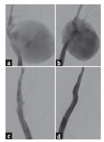
Figure 2: Cerebral angiography, (a) anteroposterior and (b) lateral views of a left common carotid artery injection, shows a giant extracranial carotid artery pseudoaneurysm, with a neck spanning the distal common carotid artery, external carotid artery, and carotid sinus. Mass effect from the pseudoaneurysm is resulting in compression and luminal narrowing of the proximal internal carotid artery. The extracranial carotid artery pseudoaneurysm was treated with an 8 mm × 38 mm Atrium Advanta V12 covered stent telescoped within a 7 mm × 50 mm Viabahn Endoprosthesis covered stent. Poststenting control angiography, (c) anteroposterior and (d) lateral views of a left common carotid artery injection, shows occlusion of the pseudoaneurysm and improved caliber of the internal carotid artery

Final control angiography demonstrated obliteration of the pseudoaneurysm and improved caliber of the previously stenotic proximal ICA, without any evidence of intracranial complications [Figure 2c and d]. The patient was prescribed dual antiplatelet therapy (aspirin 100 mg and clopidogrel 75 mg daily) for 6 weeks postoperatively, followed by monotherapy with aspirin indefinitely. Carotid Doppler ultrasonography on postoperative day 2 showed patency of the dual stent graft construct spanning the left distal CCA and proximal ICA as well as occlusion of the pseudoaneurysm. Due to the patient's multiple medical comorbidities, he remained hospitalized for a month after the stenting procedure but was eventually discharged home without postoperative neurological complications.