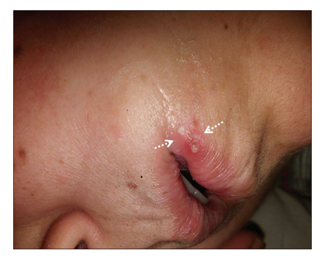
Figure 1: Erythematous vesicular lesions in left oral mucosa (arrows)

examination revealed right-sided central facial paralysis, and she was disregarding her complaints that were evaluated as apathetic. Cranial magnetic resonance imaging (MRI) showed diffusion restriction in left corona radiata and basal ganglia in the territory of lenticulostriate arteries. MRI did not yield any other chronic lesion [Figure 2]. With the diagnosis of stroke, intravenous heparin, and oral aspirin therapy were started. Cranial computed tomography angiography, performed the same day, revealed normal left M1 (middle cerebral artery first segment). Further investigations for etiological evaluation were unremarkable (Hemogram, Biochemistry, B12, folate, lipid profile, Coagulation Mutation Panel [Factor<sup>2,5,7,8</sup>, MTHFR, prothrombin G20210A mutation, Factor V Leiden], echocardiography, 24 h Holter monitoring). Hence, she was discharged with aspirin 300 mg therapy and the suggestions of dermatology outpatient control. In the follow-up, her neurological condition improved