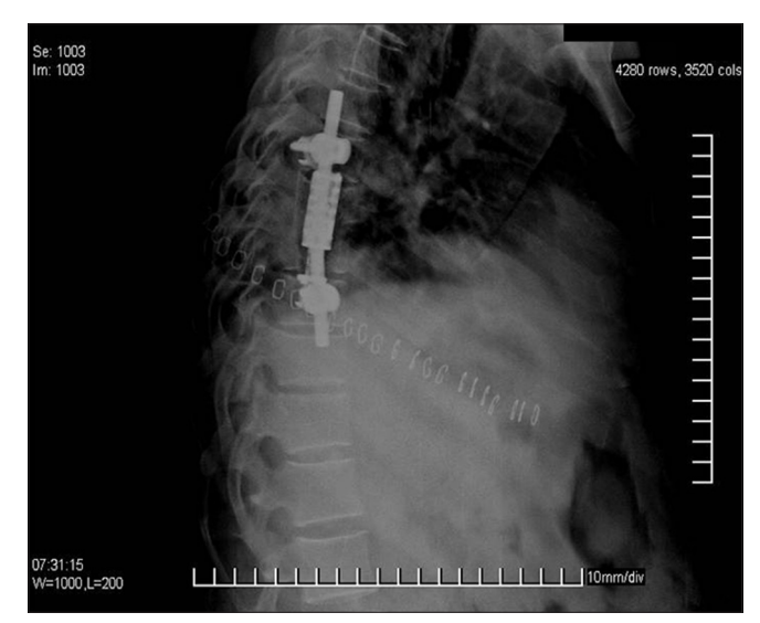
Figure 3: Postoperative X-ray dorsal spine lateral view showing D6-D9 fusion

follow-up, his back pain was relieved, and his ESR and CRP were within normal range. X-ray done at 3 months follow-up showed fusion from D6 to D9 with implants in situ .