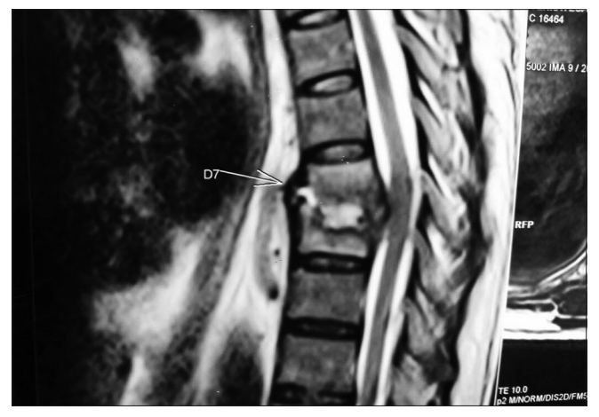
Figure 1: T2-weighted sagittal section of magnetic resonance imaging dorsal spine showing D7-D8 spondylodiscitis with prevertebral and anterior epidural granulation tissue

through intravenous route for 10 days, followed by oral levofloxacin and co-trimoxazole for 2 weeks. At 1 month