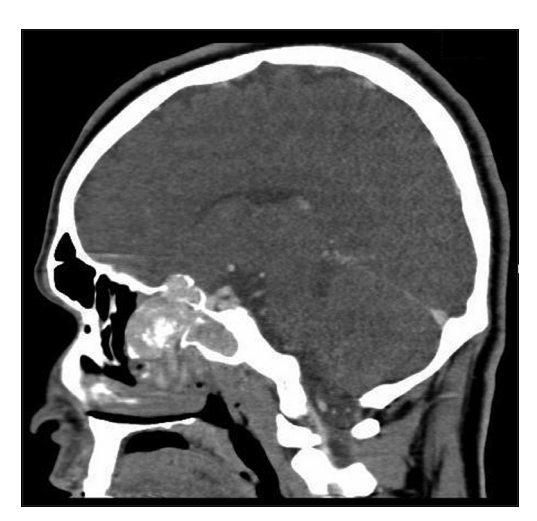
Figure 1: Sagittal CT contrast enhanced