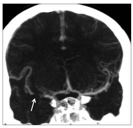
Figure 1: Coronal computed tomography angiography maximum intensity projection image showing occlusion (thin arrow) of proximal right middle cerebral artery.