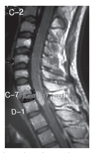
Figure 3: Gadolinium-enhanced magnetic resonance cervicodorsal spine, coronal section image showing conglomerate ring lesion at C7-D1 cervicothoracic junction suggestive of tuberculoma

The appearance of tuberculoma on MRI depend on the stage of development, maturity of rim, and content and the tuberculoma can be classified into three groups: first noncaseating lesion, others are caseating variety with central solid component and final group comprising