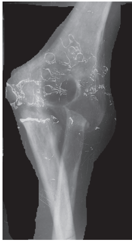
Figure 1: X-ray anteroposterior view of elbow joint showing complete destruction of elbow joint

He underwent C7-D1 laminoplasty with excision of intradural mass, the lesion was grayish with ill-defined plane of cleavage and gross total excision was carried out. The histopathological examination was compatible with caseating tuberculous lesion. He was also continued on the second-line antituberculous medication in view of multidrug resistance tuberculosis and presently awaiting arthrodesis of elbow joint.